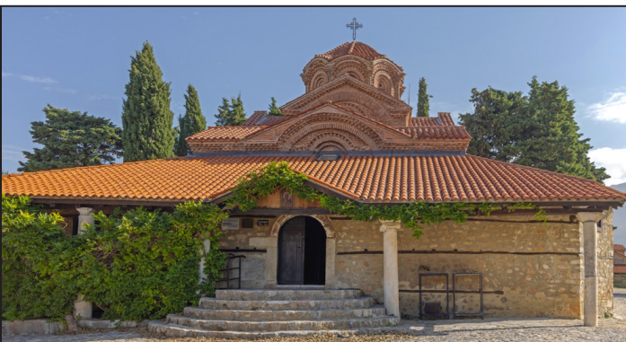
Church of the Holy Mother of Peribleptos, Ohrid, North Macedonia