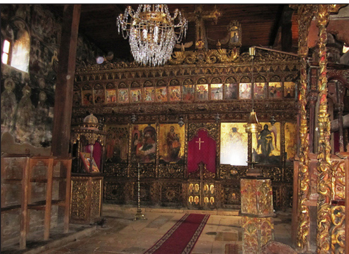
Ardenica Monastery, Albania