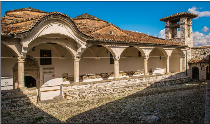
Historic Center, Berat, Albania UNESCO Heritage Site