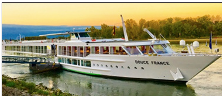
MS Douce France