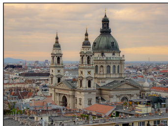
St. Stephen's Basilica, Budapest